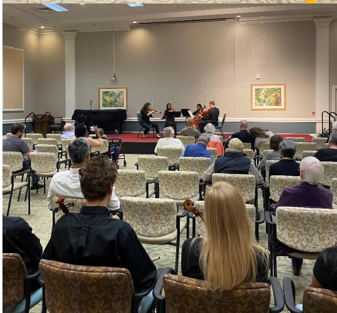
DCC Performance at the Forest at Duke Retirement Center